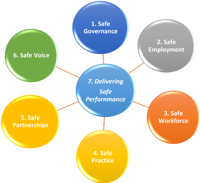
Figure 1 Swansea Model “Doing nothing is not an option – Spot it, Report it!”

1.8 Safeguarding as Everyone’s Business - Our corporate safeguarding policy continues to promote “a “Safeguarding as everyone’s business” approach, and this applies to: